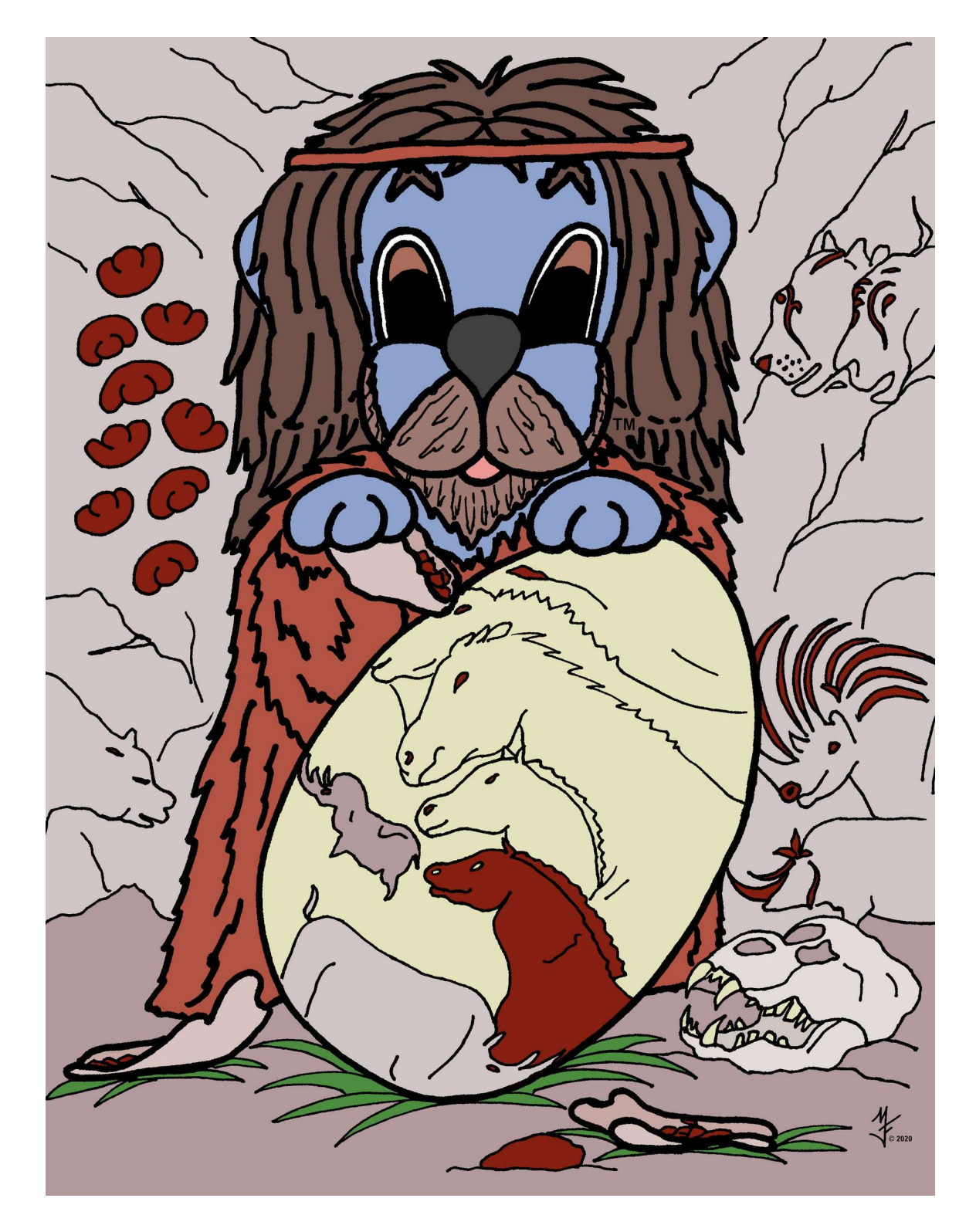
Copyright \textcircled{\sc c} 2020 Yummee Yummee. All rights reserved worldwide.